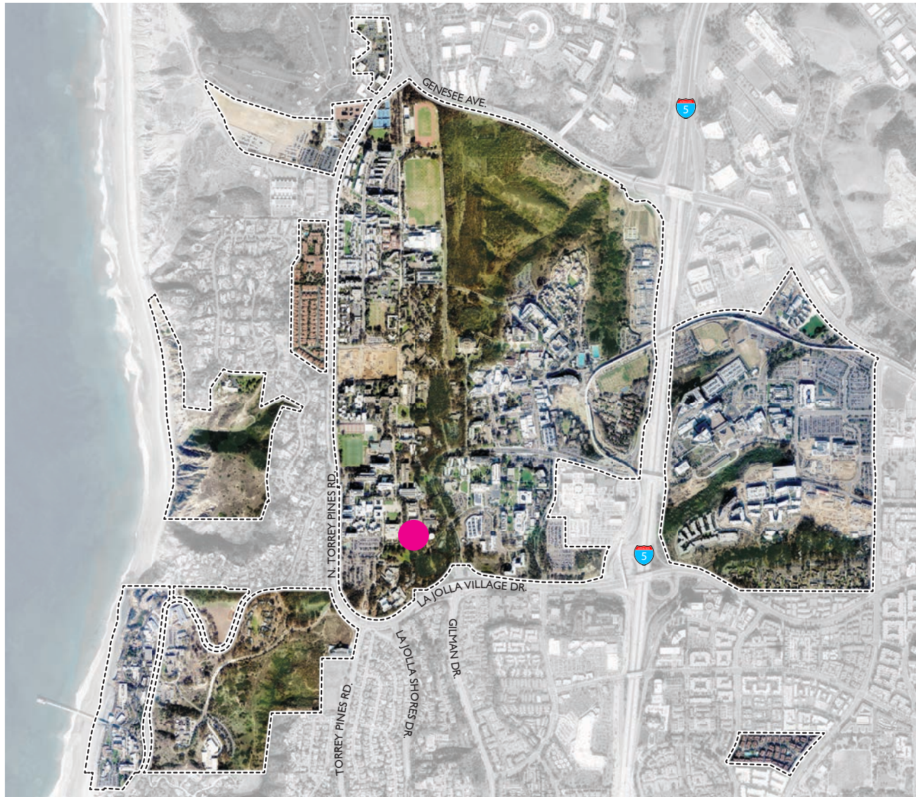
UC SAN DIEGO CAMPUS - PROPOSED PROJECT SITE LOCATION