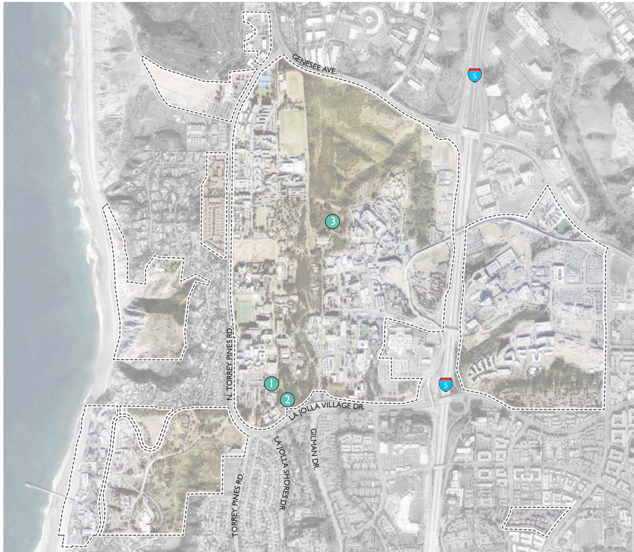
UC SAN DIEGO CAMPUS - ALTERNATIVE SITE LOCATIONS